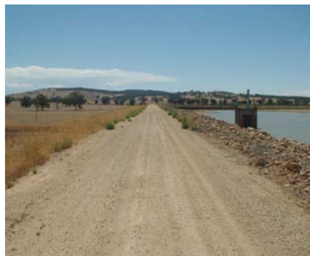
Lake Mokoan embankment