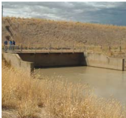
Lake Mokoan outlet

The future wetland will spill more naturally via a sill made by a breach in the Mokoan embankment (dam wall). The current outlet tower and conduit are not required for future control of spill operations however, retention of the outlet conduit may provide future benefits for Winton Wetland rehabilitation. Options for the future of the outlet conduit are the subject of further assessment.