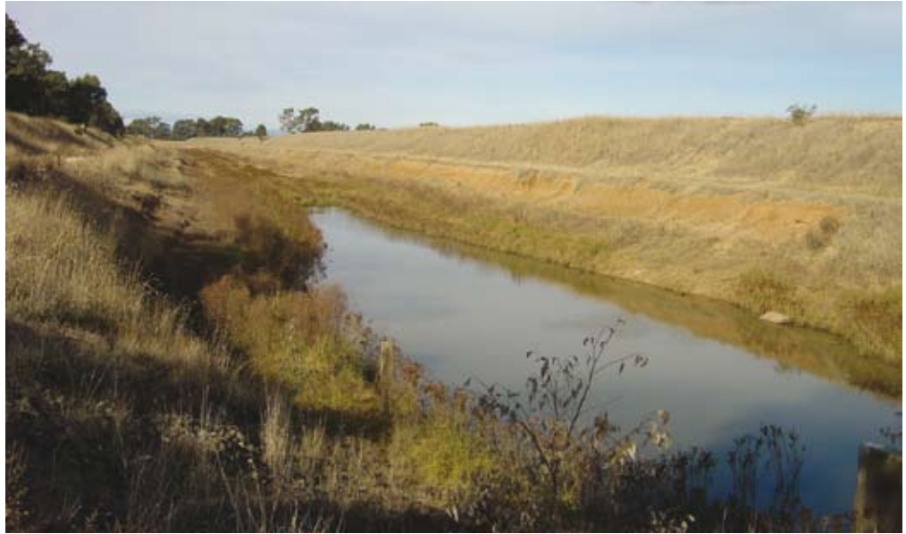
Lake Mokoan inlet channel

All drainage structures, including the Kennedy's Creek inlet structure would need to be retained largely in their current form